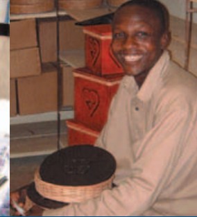
Aid To Artisans / Ghana