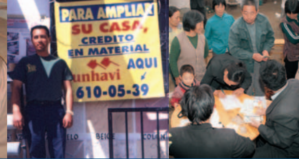
Fundación Hábitat y Vivienda / Mexico