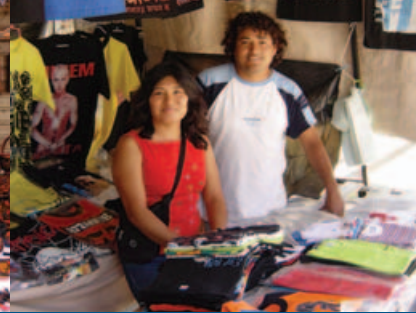
El Fondo de Inversión Social / Argentina