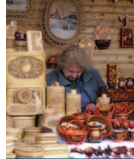
Russian Women's Microfinance Network / Russia

We support a broad range of activities, methodologies, and organizations that seek to promote economic security and reduce the vulnerability of the poor. These include